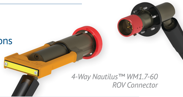
4-Way Nautilus™ WM1.7-60 ROV Connector

60 Amp Nautilus connector designed for applications with increased electrical current requirements