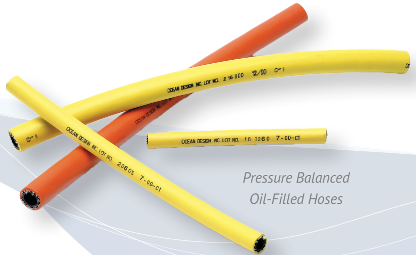
Pressure Balanced Oil-Filled Hoses